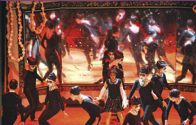
Orchards Community School