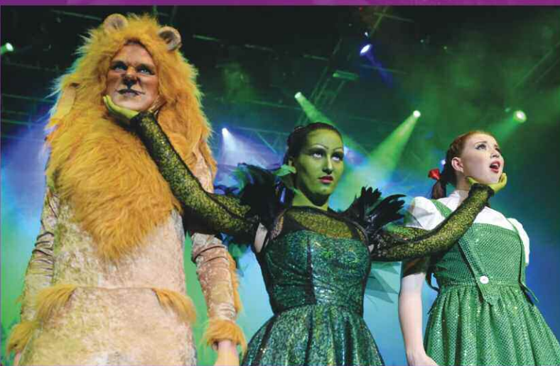
West Lakes Academy

Orchards Community School, Worthing, West Sussex