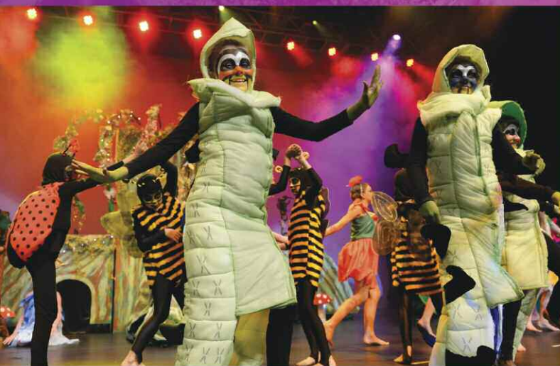
Hornsea Community Primary School

'Best in show' is a celebration of man's best friend. Dog lovers up and down the country have been watching in amazement at the skill, beauty, commitment and determination of these creatures. Are we so different as humans? Our personalities and skills make us good at something so it's your time to shine and be 'Best in Show'.