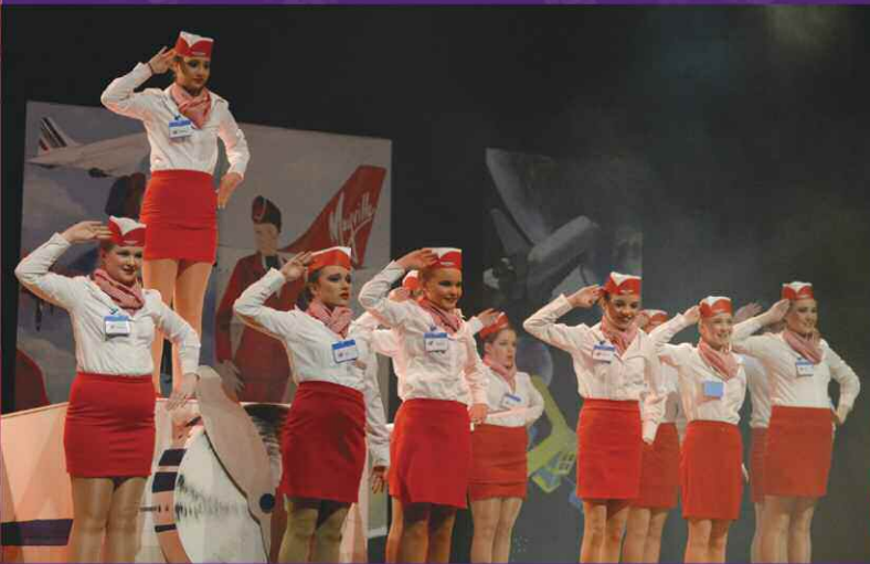
Mayville High School

It's known as 'The Sport of Kings' – but not for poor Stan, the racecourse handyman, as he starts yet another thankless day of hard work. Finally the sweeping is done, the drinks are poured and the gates are opened ready for the glamour, drama and excitement of a day at the races. Who will be first past the winning post?